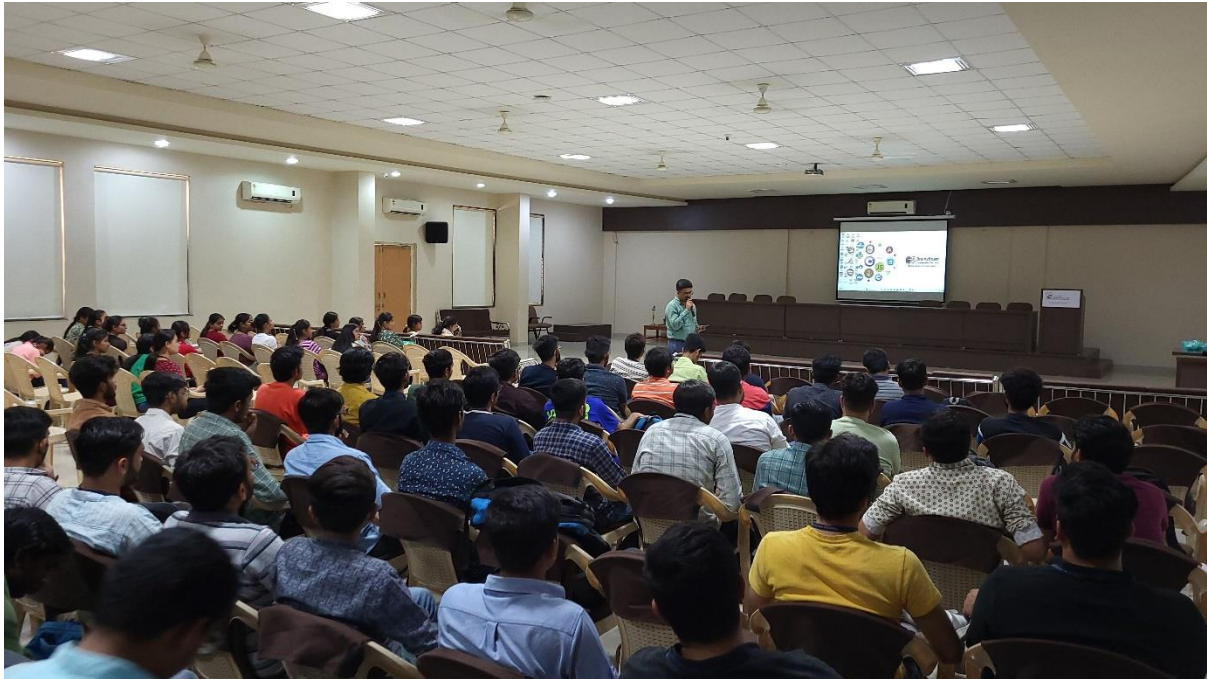
"Attending session about Ethics"