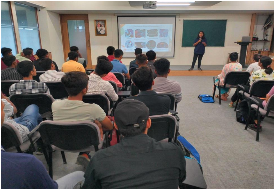
"Students are Aware about ISRO"