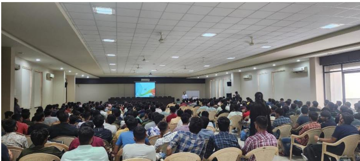
"Attending Session and Clear Doubts"